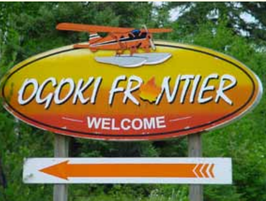
Feeling right at home - we supply drinking water . . . cubed ice and propane chest freezers.