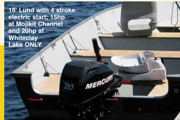
16' Lund with 4 stroke electric start; 15hp at Mojikit Channel and 20hp at Whiteclay Lake ONLY.