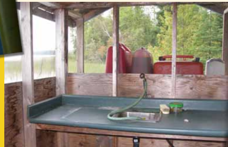
Typical screened-in fish cleaning house with running water.

Go to www.ogokifrontier.com for more details