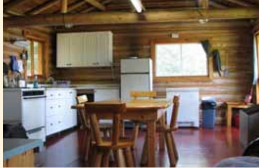
Spacious Kitchen - Pickett Lake