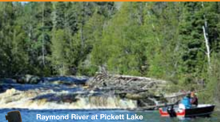
Raymond River at Pickett Lake