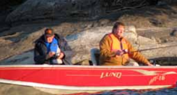
Meet New Friends - Whiteclay Lake