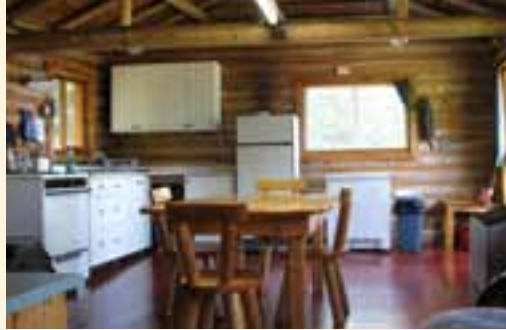
Spacious Kitchen - Pickett Lake